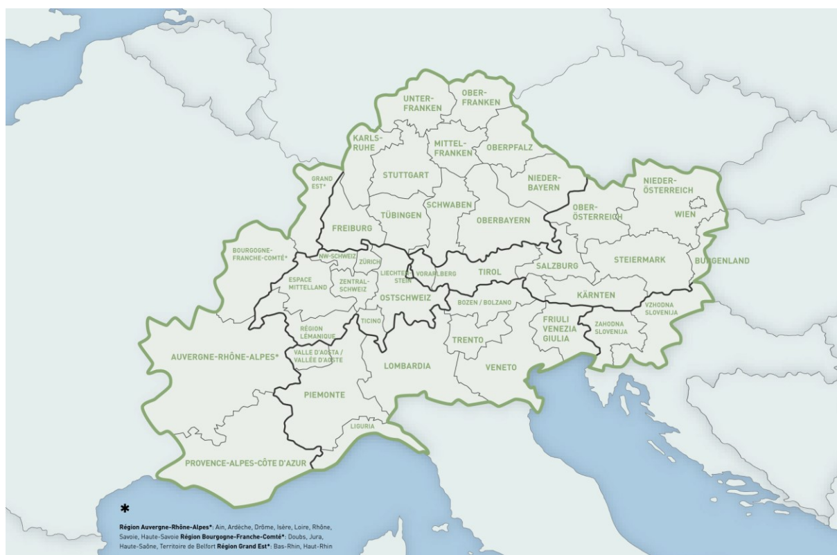
Figure 1: Map of the cooperation area

Interreg Alpine Space Programme 2021-2027, illustration by iService.