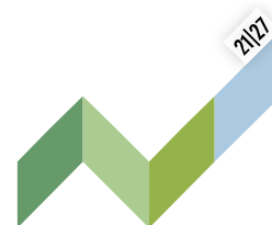
Table of Annexes