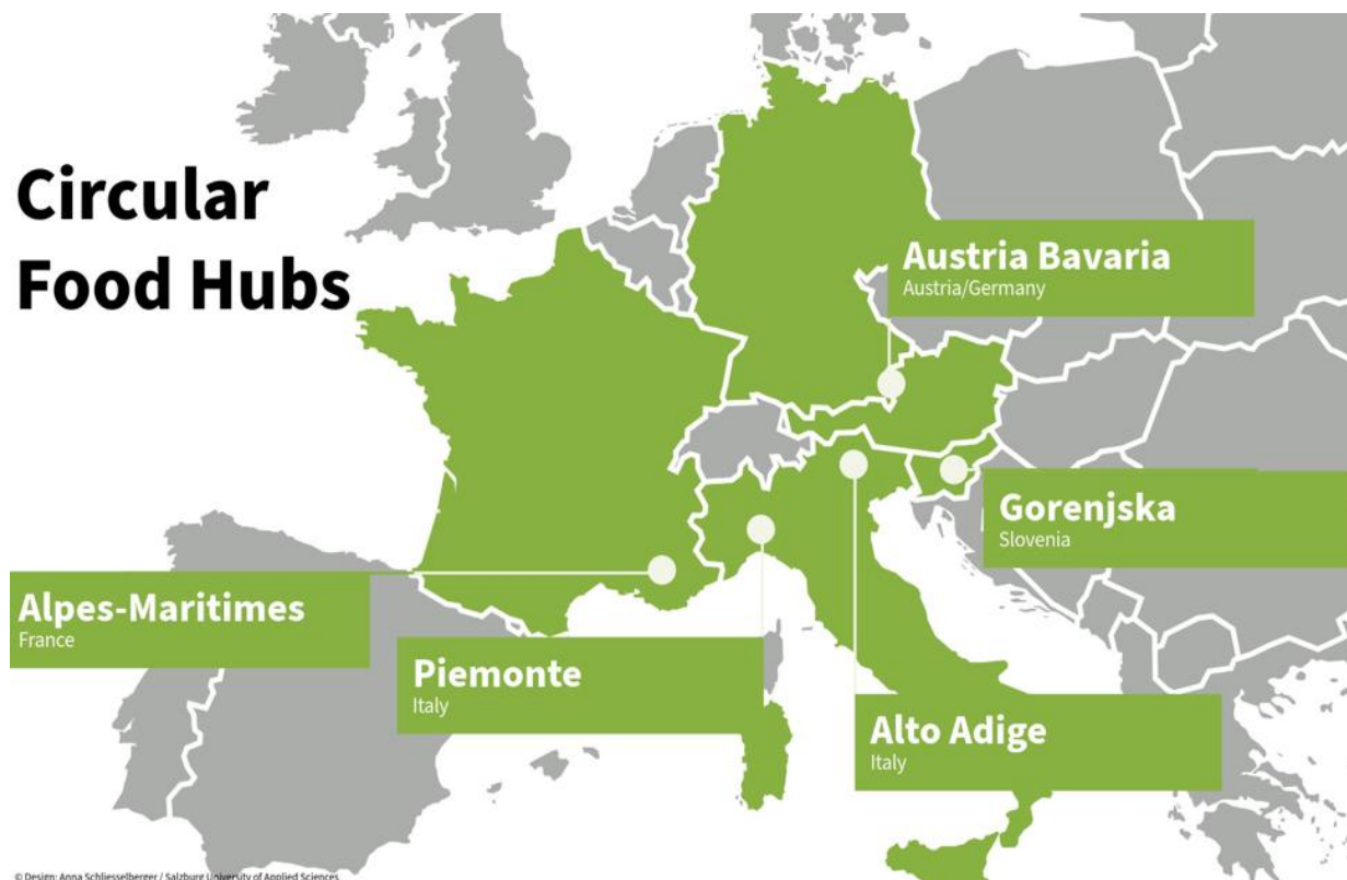
Fig.1: Locations of the Pilot Circular Food Hubs in the Alpine Space