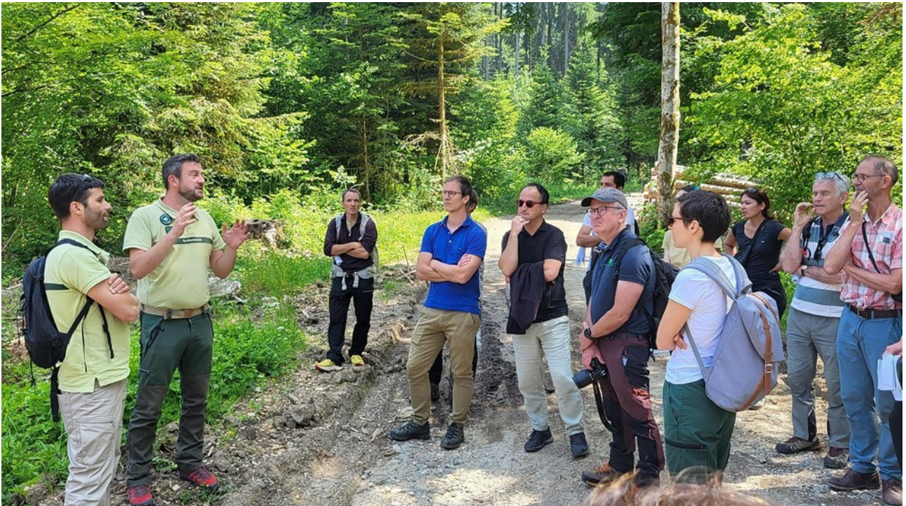
Field trip in Semnoz public forest