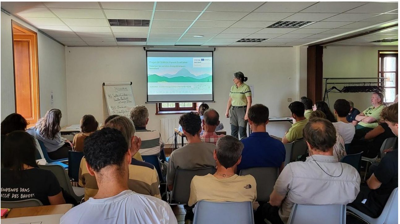
Presentation of Forest Eco Value project and Living Lab