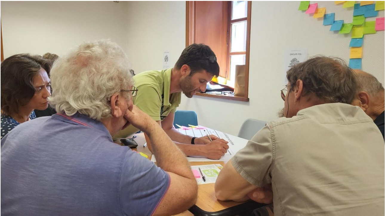
Workshop about forest ecosystem services