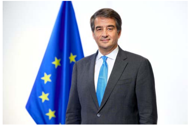
Raffaele Fitto, Vice-President of the European Commission and Executive Vice-President for Cohesion and Reforms

By bridging local and regional initiatives with European priorities, EUSALP remains a model for cooperation and innovation, both within and beyond the European Union. As we celebrate ten years of EUSALP, I would like to thank everyone who has contributed to its success. Together we are building a better, stronger, and more resilient Europe.