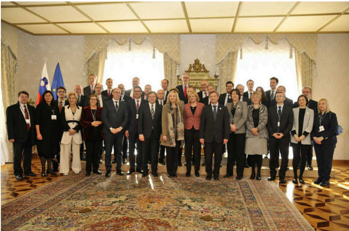
EUSALP General Assembly #1, Slovenia 2016.

During Slovenia's 2016 EUSALP presidency, key recommendations for further work were drafted to improve EUSALP management, regional cooperation and visibility.