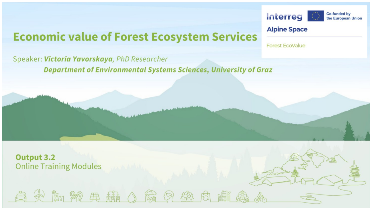
Figure 2: Banner from the second online training module