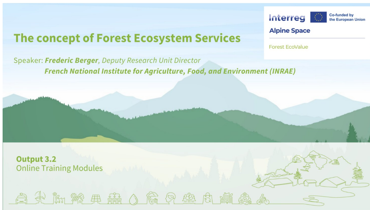
Figure 1: Banner from the first online training module

The first training module introduces the concept of Forest Ecosystem Services (FES) and provides the methodological foundations for their assessment within the Forest EcoValue project.