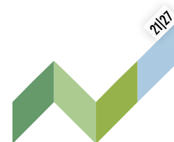
Table of Annexes