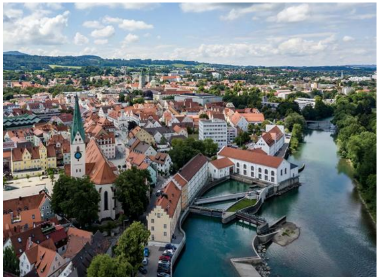
City of Kempten

Since 2012 the city of Kempten has participated in the European Energy Award (gold status certification in 2020) and already developed an ambitious climate protection strategy in 2013 which was updated in 2022 with the aim to reach climate neutrality in 2035. In recent years the city also developed a solid basis of climate adaptation related concepts. Since 2021 an urban climate study and heavy rain analysis have been available and after several workshops with local stakeholders the climate adaptation plan was adopted by the city council in 2022.